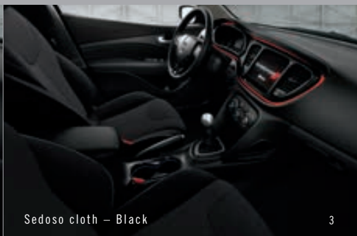
Sedoso cloth – Black