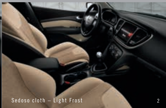
Sedoso cloth – Light Frost