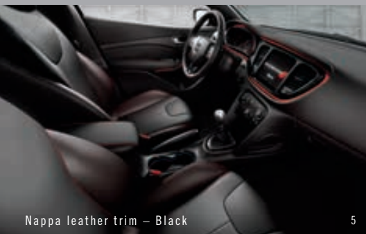
Nappa leather trim – Black