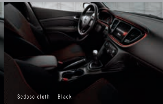
Sedoso cloth – Black