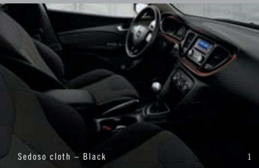
Sedoso cloth – Black