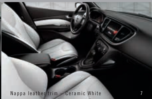
Nappa leather trim – Ceramic White