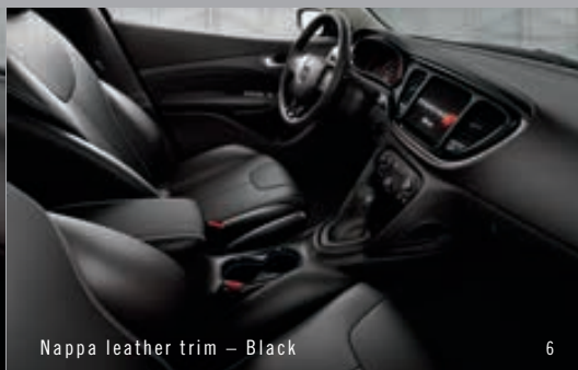
Nappa leather trim – Black